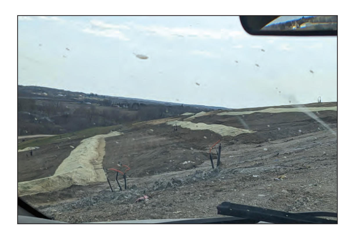
East slope of Cap project