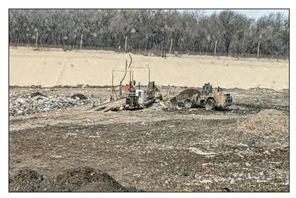
Tipper in Phase 4 at top of West slope