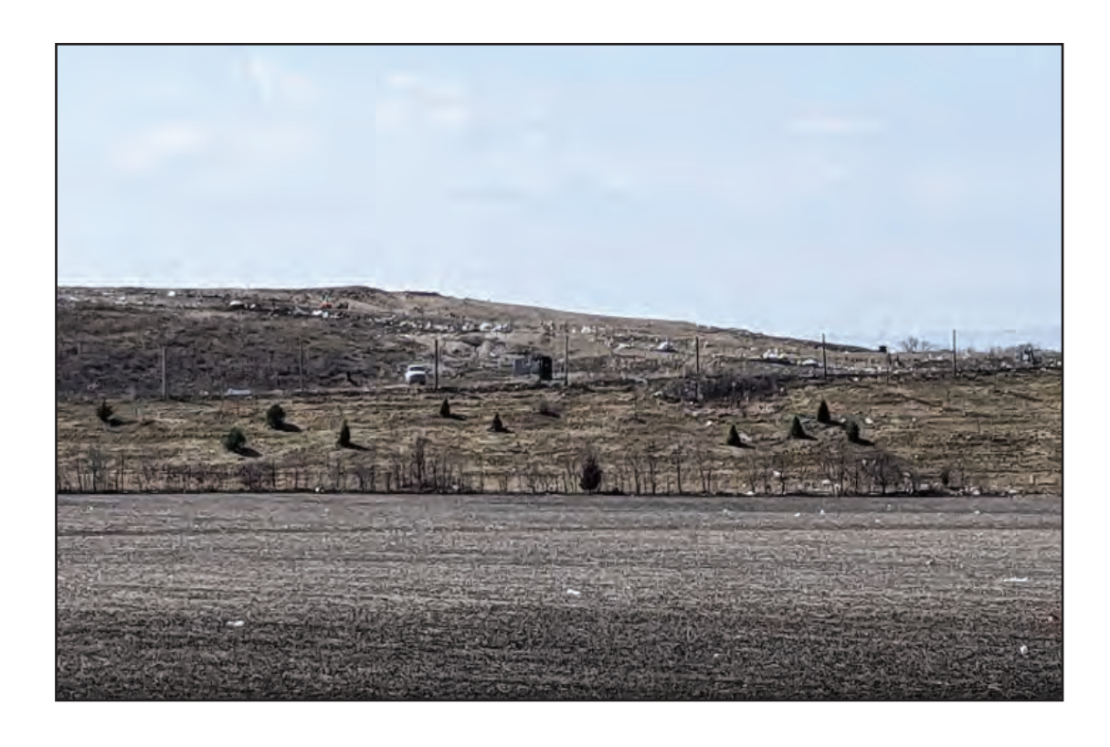
Northeast corner of Landfill footprint, high winds have spread litter