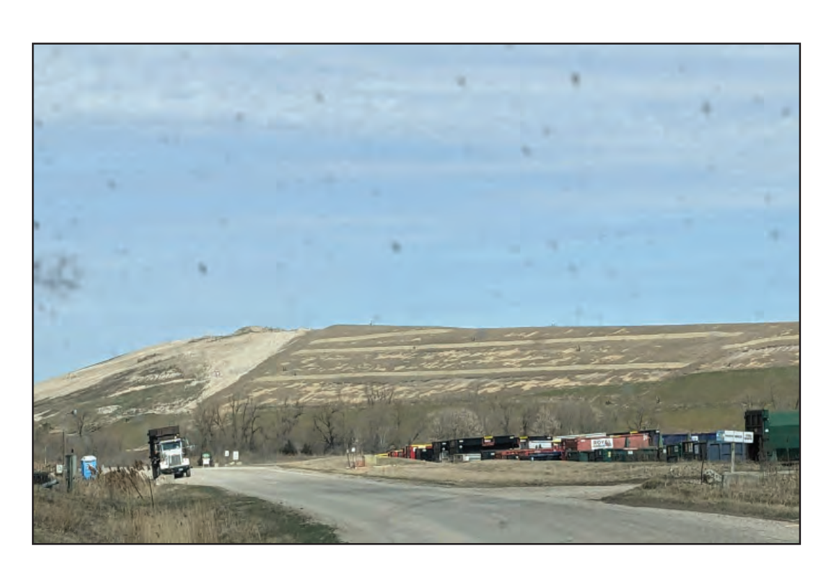
West slope of Cap project