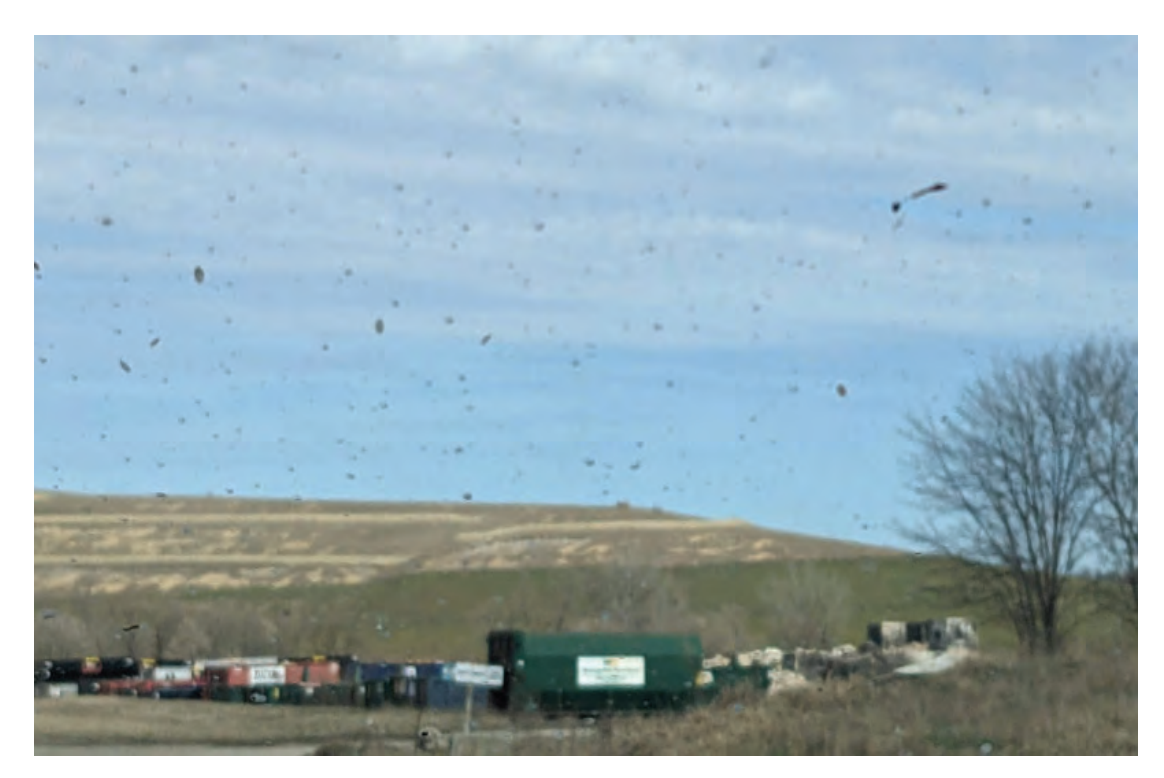
West slope of Cap project