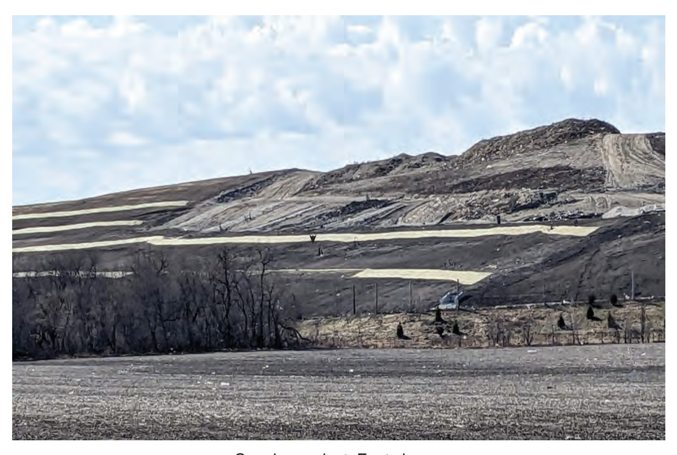
Capping project, East slopes