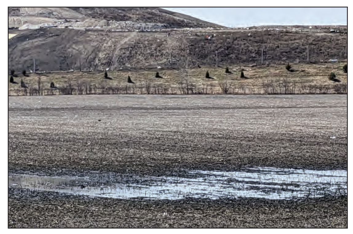
East slope of Phase 3 and 4 viewed from the Northeast