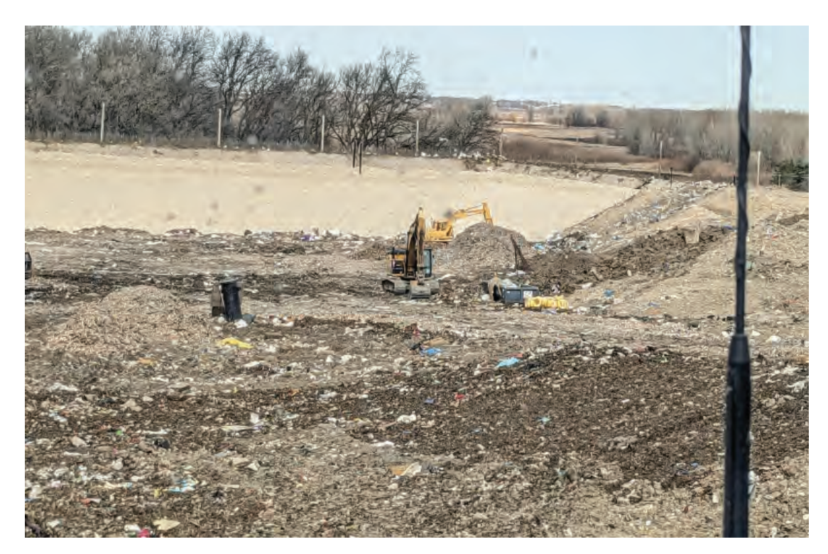
View across Phase 4, South to North