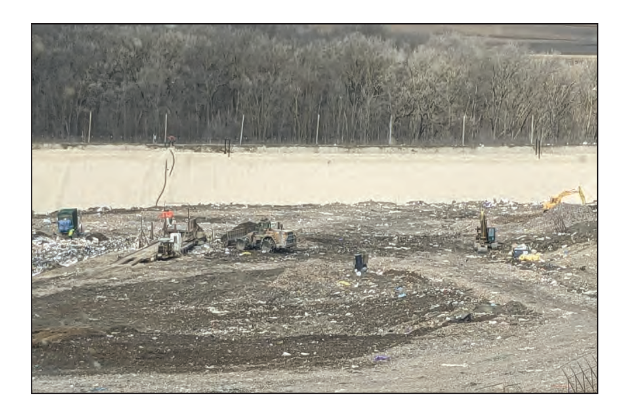
Active area of Phase 4, all one grade