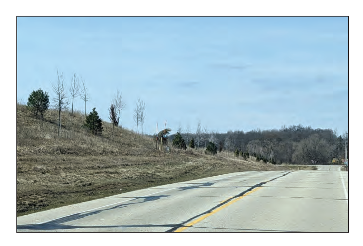
Northern screening berm