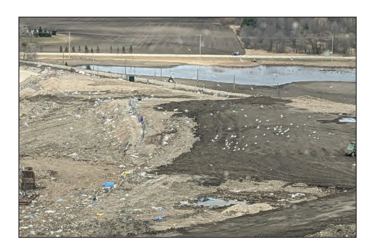
Phase 3 & 4 being brought to same elevation