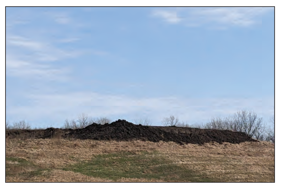
Top soil stock pile adjacent to concrete yard