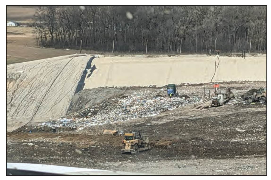
Tipping on West slope, outboard slope, finishing fluff layer