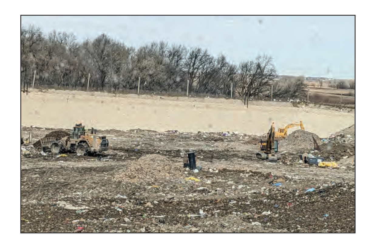
Phase 4 all at one grade and well below cresting