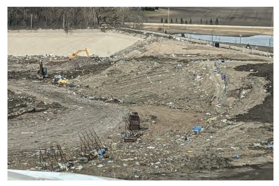
Phase 4, Northeast corner, well below crest