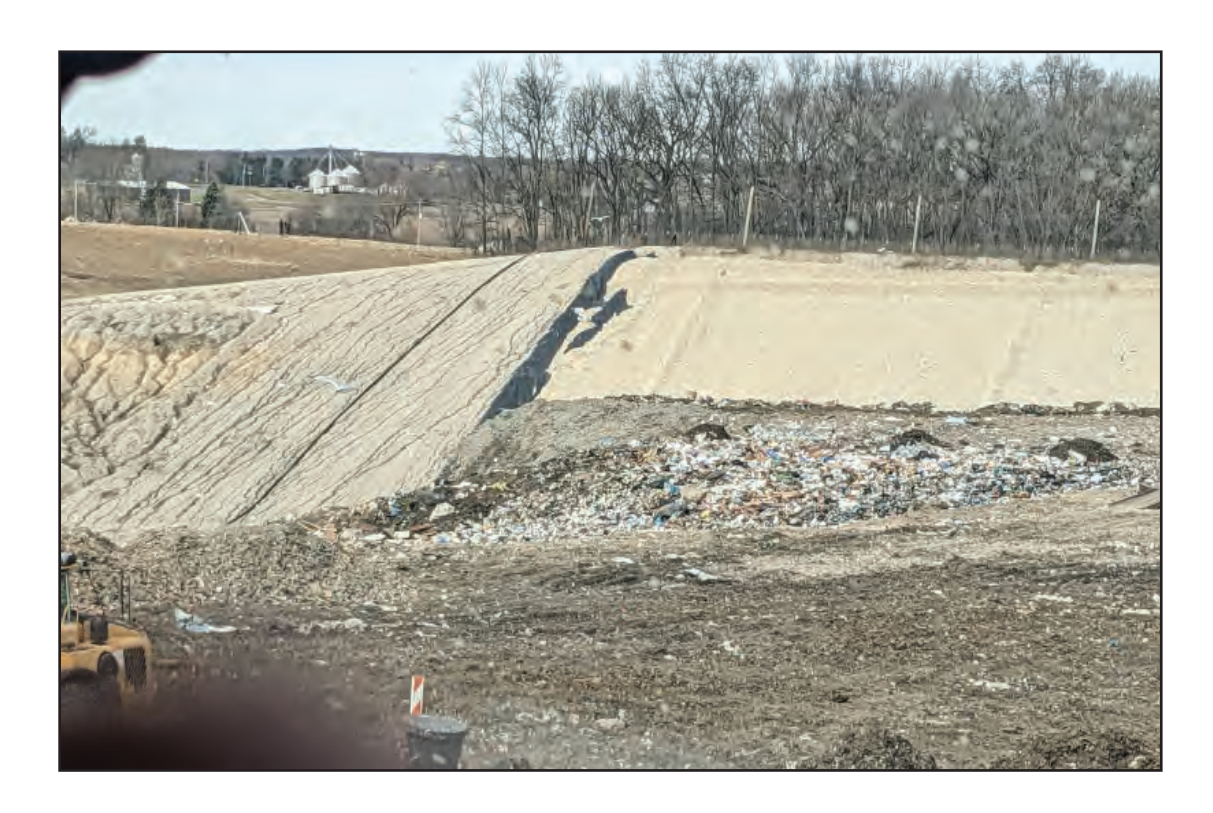
Tipping on West slope, finishing fluff layer