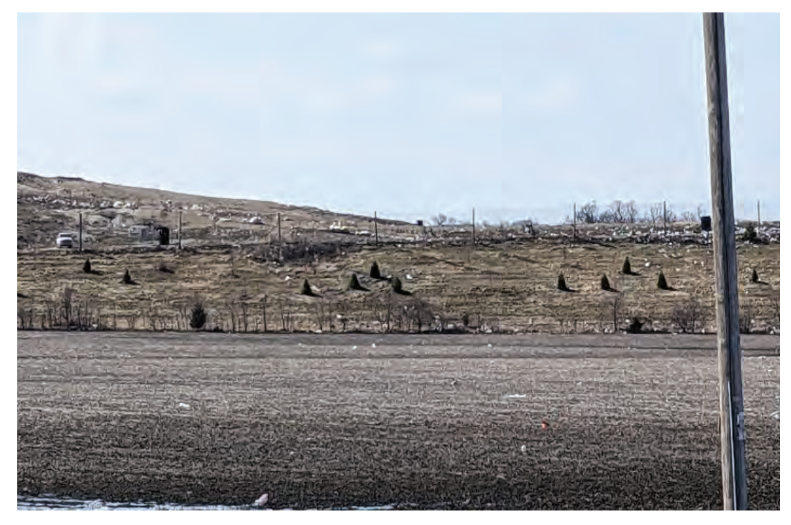
Northeast corner of Landfill footprint, high winds have spread litter